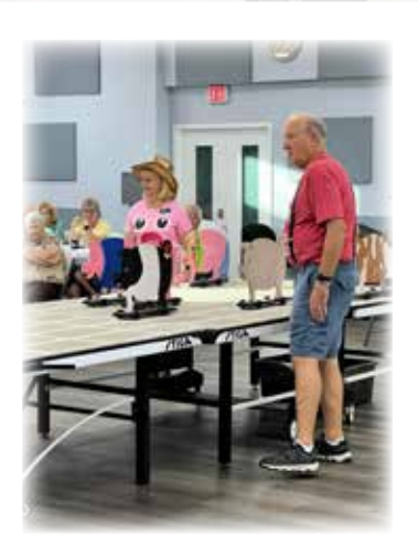
Pig Races - April 4th